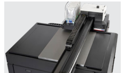
*From flatbed to integrated rotatory for cylindrical items